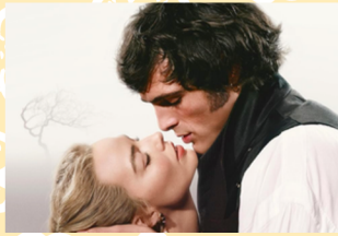
5/8 WUTHERING HEIGHTS R · 2026 · ROMANCE 2H16M