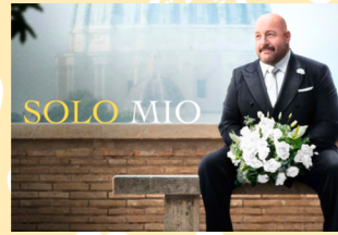
5/15 SOLO MIO PG · 2026 · ROMANCE/COMEDY 1H 37M