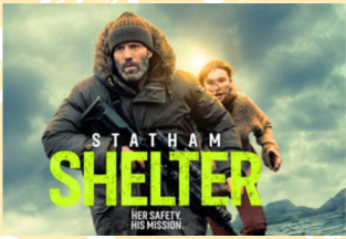
5/1 SHELTER R · 2026 · ACTION/ADVENTURE 1H 47M

Take in a movie at the library! Join us at 1PM each Friday to watch a film and have some snacks in our Community Room.