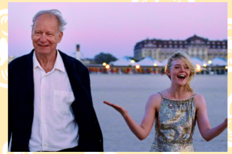
5/22 SENTIMENTAL VALUE R · 2025 · DRAMA/TRAGICOMEDY 2H13M