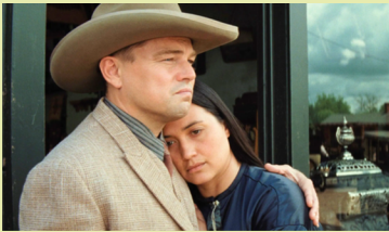
4/10 KILLERS OF THE FLOWER MOON R · 2023 · WESTERN/THRILLER · 3H 26M

Take in a movie at the library! Join us at 1PM each Friday to watch a film and have some snacks in our Community Room.