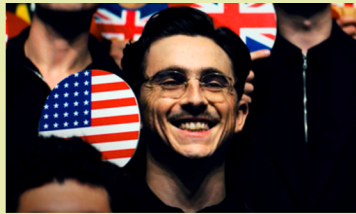
4/17 MARTY SUPREME R · 2025 · SPORT/DRAMA · 2H 29M