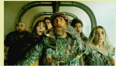
4/24 GOOD LUCK, HAVE FUN, DON'T DIE R · 2025 · SCI-FI/ACTION · 2H 15M