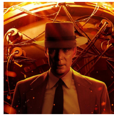
Oppenheimer Dec. 8 R 3 hr