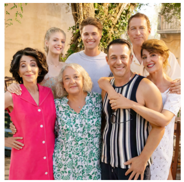
My Big Fat Greek Wedding 3 Dec. 15 PG-13 2 hr, 23 min