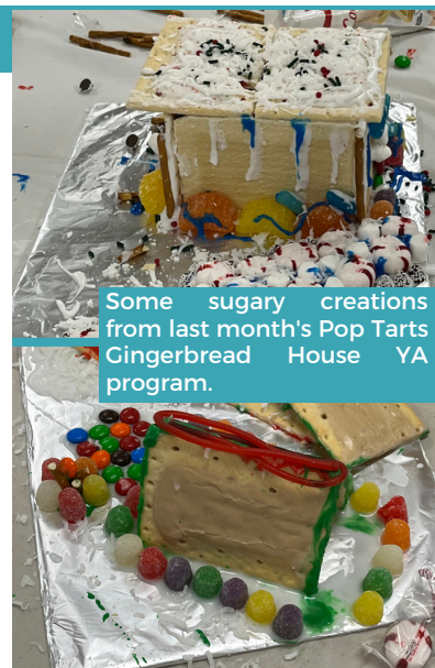
Some sugary creations from last month's Pop Tarts Gingerbread House YA program.

To find other volunteering opportunities please visit douglaslibrary.org for the teen volunteering request form. Email teens@douglaslibrary.org with questions!