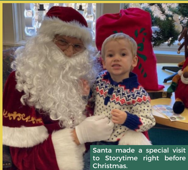
Santa made a special visit to Storytime right before Christmas.