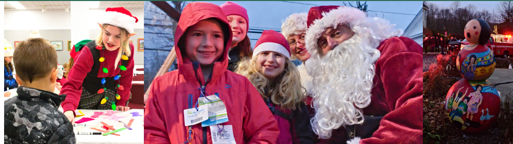
The Hebron Holiday Celebration was delayed a day, but lots of families joined us on 12/4 to see Santa, light the town tree, and kick off the holiday season!