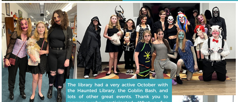
The library had a very active October with the Haunted Library, the Goblin Bash, and lots of other great events. Thank you to everyone who participated. What a fun month!

The Flour Girl Bakery, located just a few doors down from the library on 14 Main Street, has started a new program to incentivize children aged 15 and under to use their library cards more often. Participants in the Cookie Book Club will receive a piece of candy for each library receipt that they bring to the Flour Girl Bakery. After five receipts, readers receive a free cookie. Make a plan to stop at the bakery after your next trip to the library!